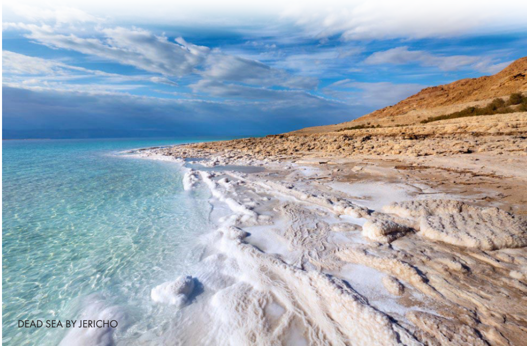
DEAD SEA BY JERICO