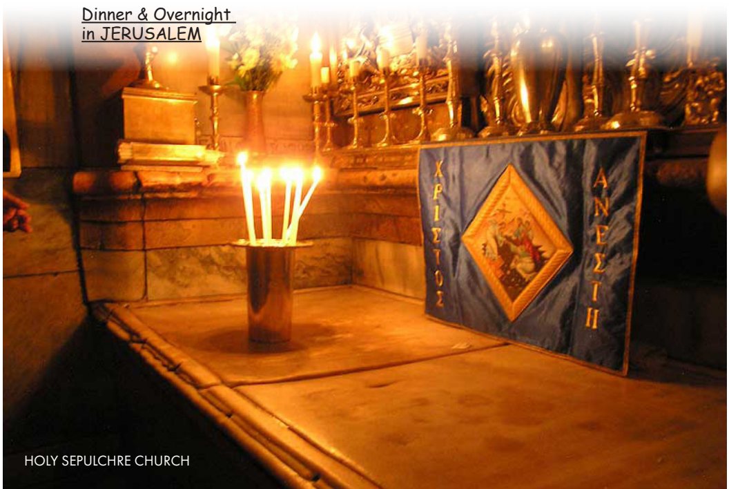
HOLY SEPULCHRE CHURCH