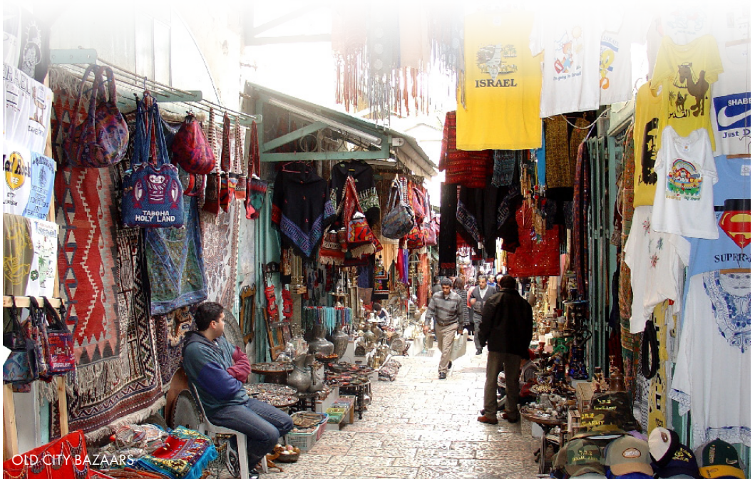
OLD CITY BAZAARS

After breakfast, travel to Ben Gurion airport for the morning return flight to London Heathrow.